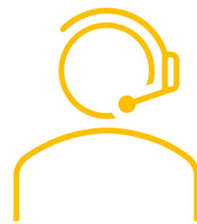
Teams Apps & Solutions